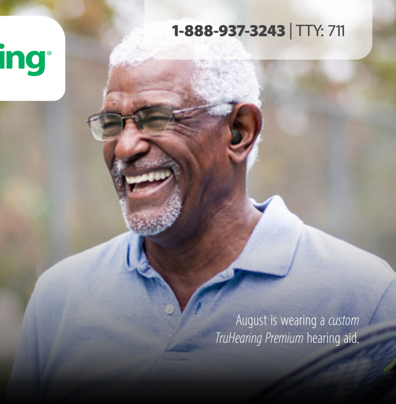
August is wearing a custom TruHearing Premium hearing aid.

Thanks to your Mass General Brigham Health Medicare Advantage Plan, you have access to tremendous savings through TruHearing®. Your 2024 hearing benefit covers up to two TruHearing Advanced or Premium hearing aids per year with low copayments.